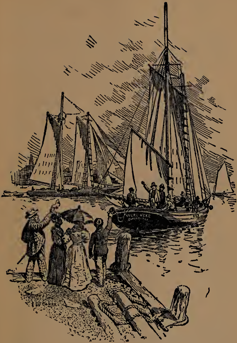
BIDDING FAREWELL TO THE "WE'RE HERE."